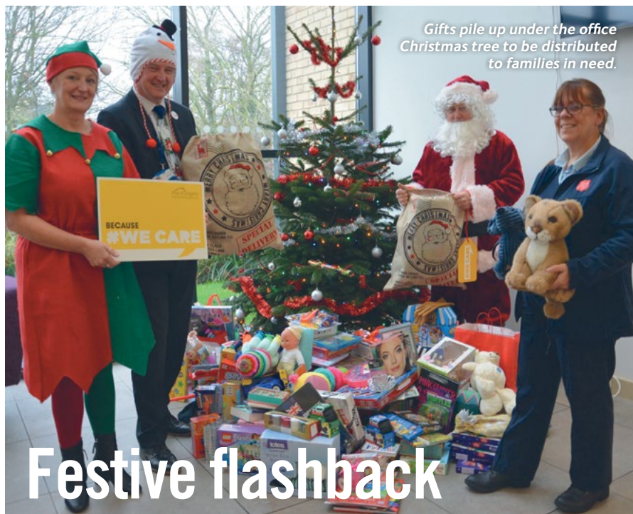
Gifts pile up under the office Christmas tree to be distributed to families in need.

If you'd rather pay by text, this is a secure payment facility. Just register your details by going to www.allpayments.net/textpay . You will need your payment reference number.