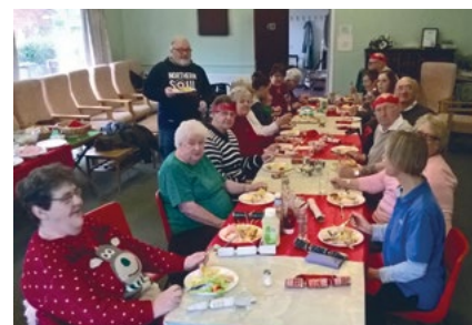
Deanholme residents share their festive good cheer.

toys, DVDs, games and clothes to help local parents struggling over the Christmas period, and we were so proud of their generosity.