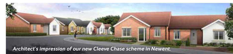
Architect's impression of our new Cleeve Chase scheme in Newent.

market under our new Tandem Living banner – raising vital funds that will allow us to continue building homes for low-cost rent.