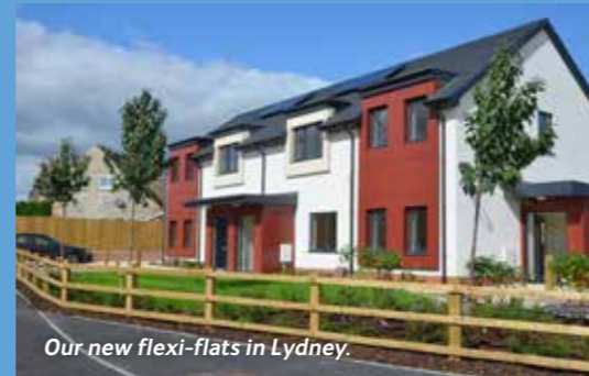
Our new flexi-flats in Lydney.

The four one-bedroom 'flexi-flats' and two two-bedroom houses are all set at affordable rent, and help to meet the demand for smaller, low-cost homes in the Lydney area.